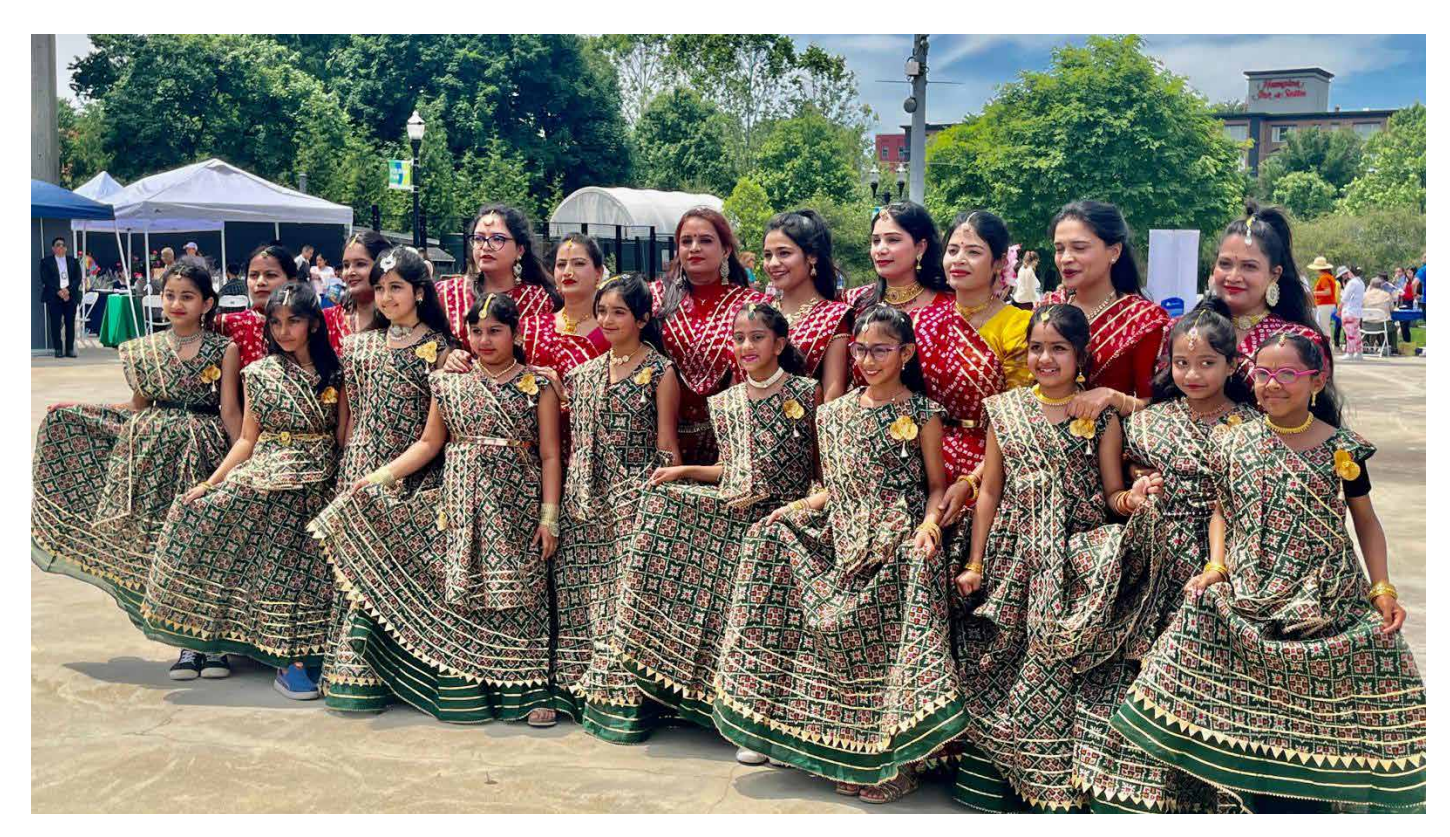
Gujarati Dancers at the Stamford Day Celebration

Stamford's history and diversity. Stamford was founded on May 16th, 1641, 383 years ago, and has grown into one of the most