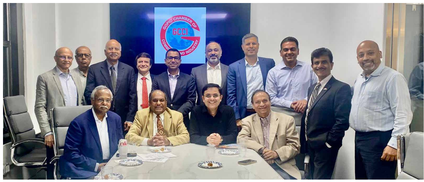
GCCI Meeting held on May 23rd in New York City.

fter relaunching the GOPIO Chamber of Commerce and Industry (GCCI) at the GOPIO Convention 2024 in April 2024, GCCI held a brainstorming session.