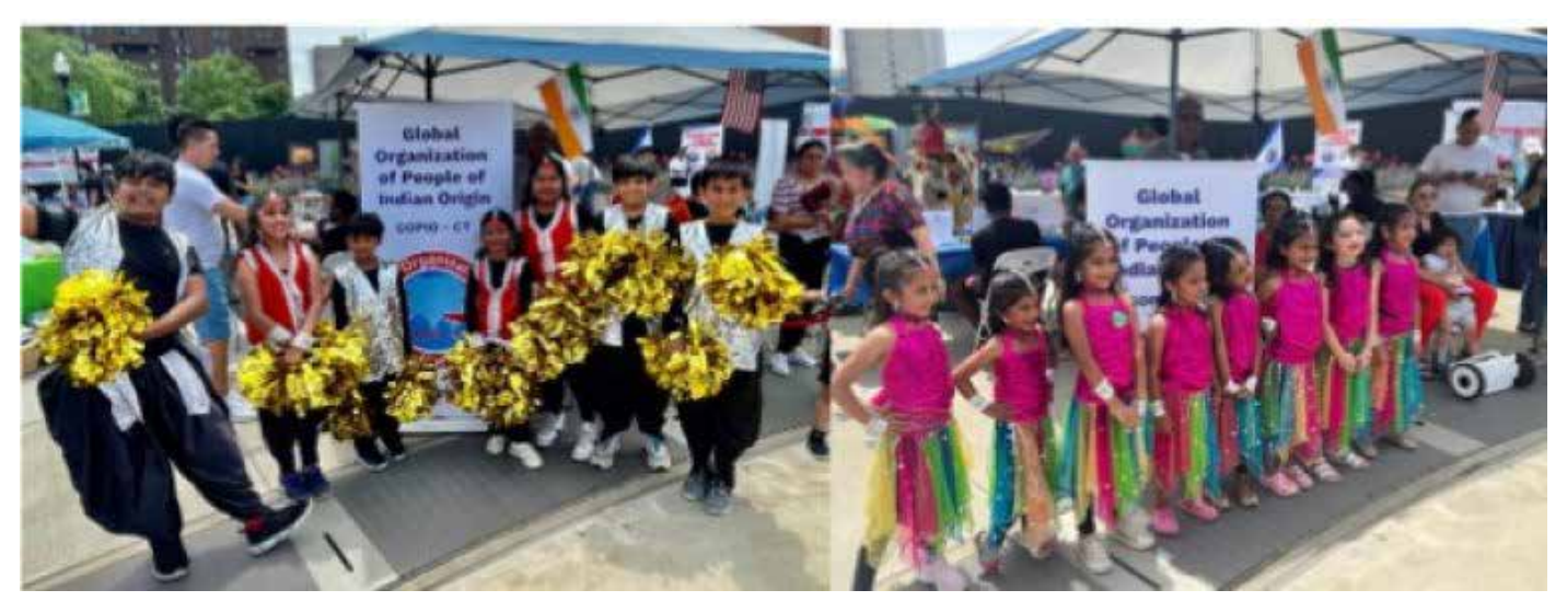
Young Bollywood Dancers at the Celebration

he Global Organization of People of Indian Origin—Connecticut Chapter (GOPIO-CT) has been