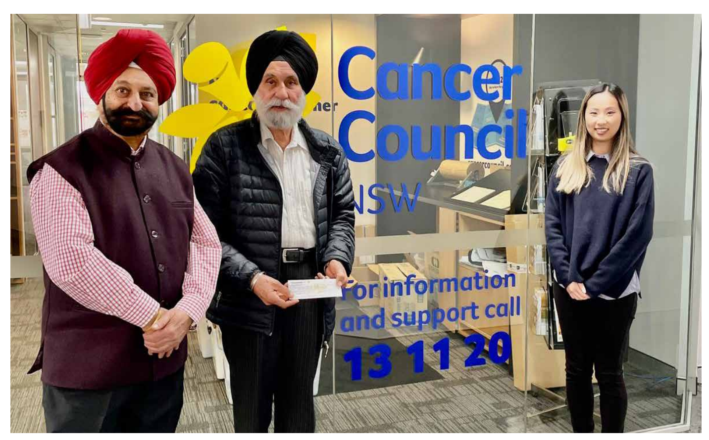
for Small Business, Lands and Property, Multiculturalism and Sport.