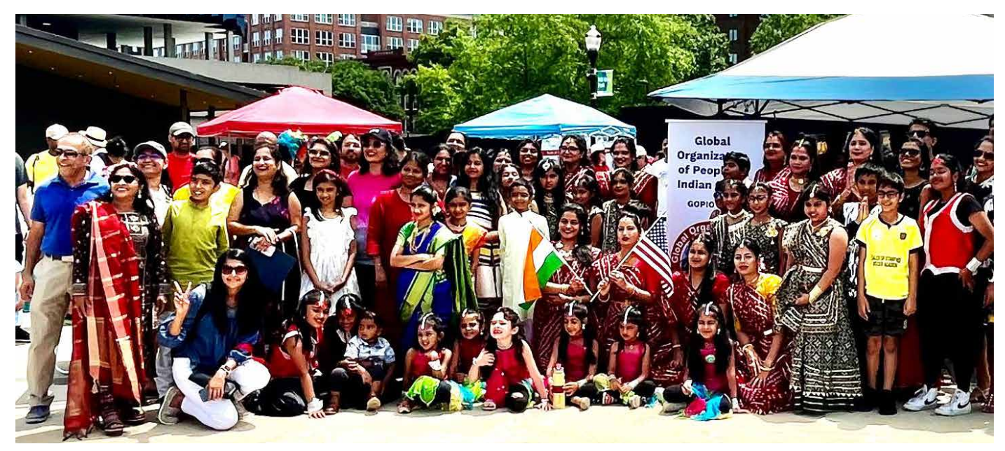
All dancers, parents with GOPIO officials

Mill River Park is located in Downtown Stamford, like Central Park for Stamford.